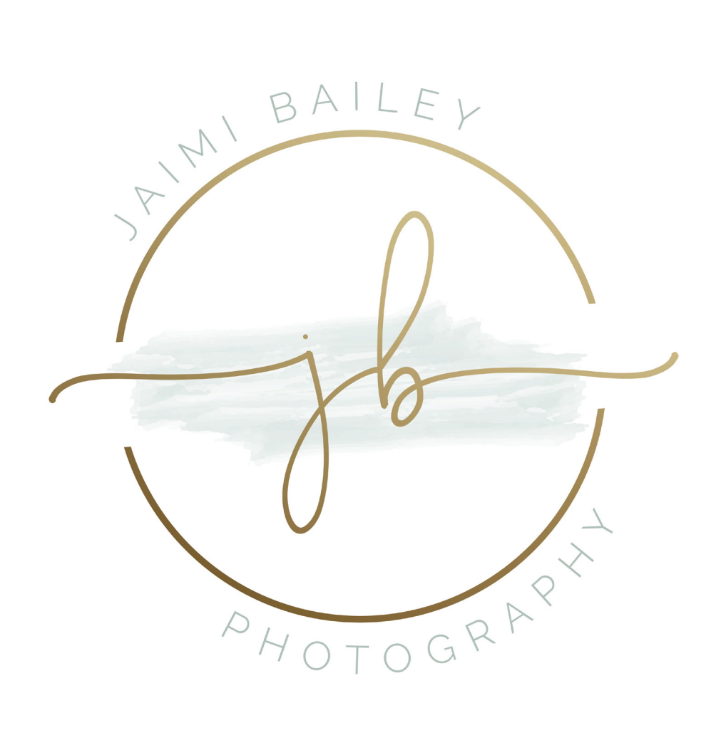
Your Experience starts here!